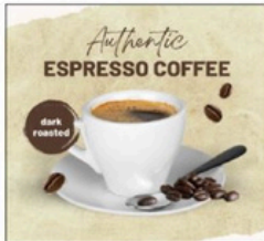
Available in single & double shot