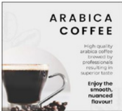
Subtle notes of chocolate & berries