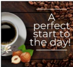
Vanilla & Toasted Hazelnut Joy!

Say good-bye to coffee boredom! We are specialists who have made it our life's work to make quality the highest priority. This is not the work of only one person in the lifecycle of a coffee bean; speciality can only occur when all of those involved in the coffee value chain work in harmony and maintain a keen focus on standards and excellence from start to finish.